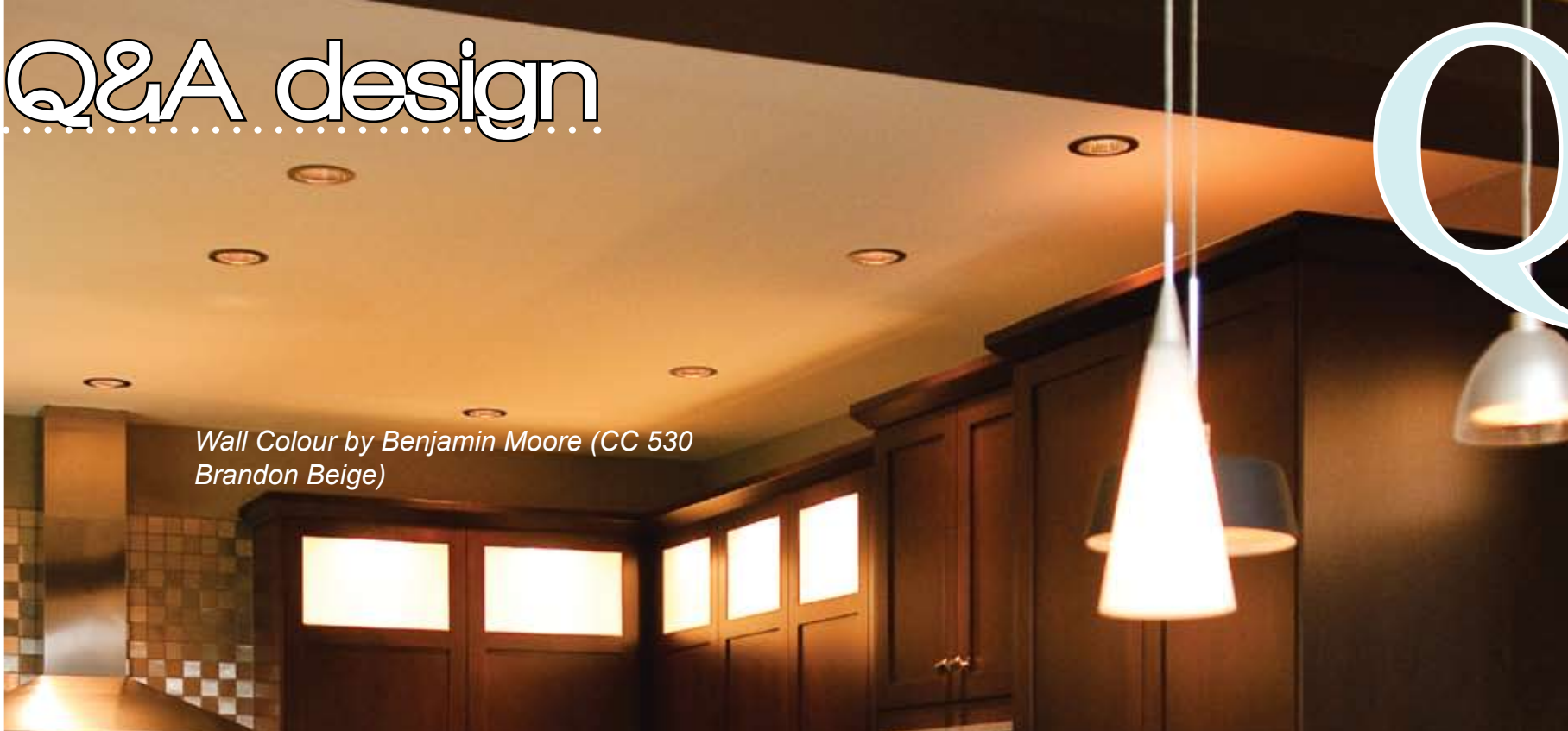
Wall Colour by Benjamin Moore (CC 530 Brandon Beige)